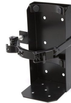
Heavy-Duty MB810C MB810A MB811C MB812A Black