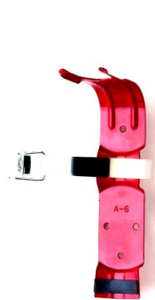
MB817C MB817A Red