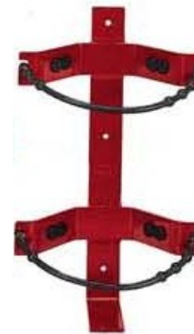
MB862A MB864A Red