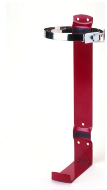
MB846C MB846A Red